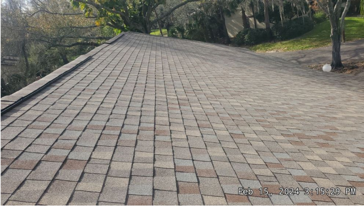
Project: STRATHMORE GATE - 2961-2971 BUTTONBUSH CT / 2310-5006192-01 Date: 2/15/2024, 3:15pm