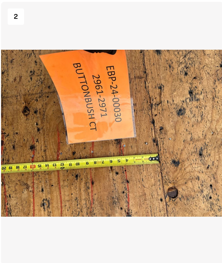
Project: STRATHMORE GATE -2961-2971 BUTTONBUSH CT / 2310-5006192-01 Date: 2/13/2024, 3:08pm