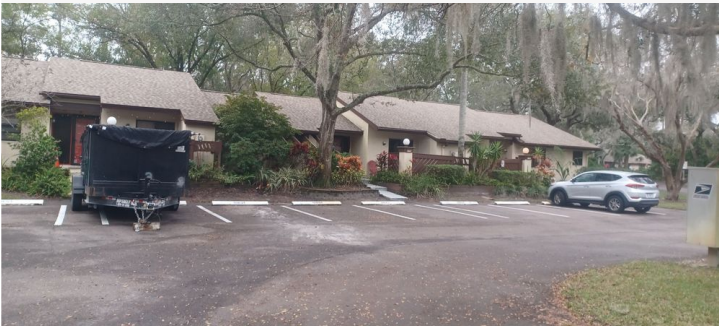
Project: STRATHMORE GATE - 4045-4049 ARROWWOOD CT / 2310-5005547-01 Date: 1/4/2024, 10:45am