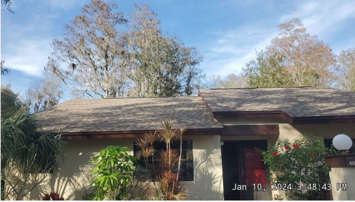
Project: STRATHMORE GATE - 4032-4036 HONEYLOCUST CT / 2310-5005622-01 Date: 1/10/2024, 3:48pm