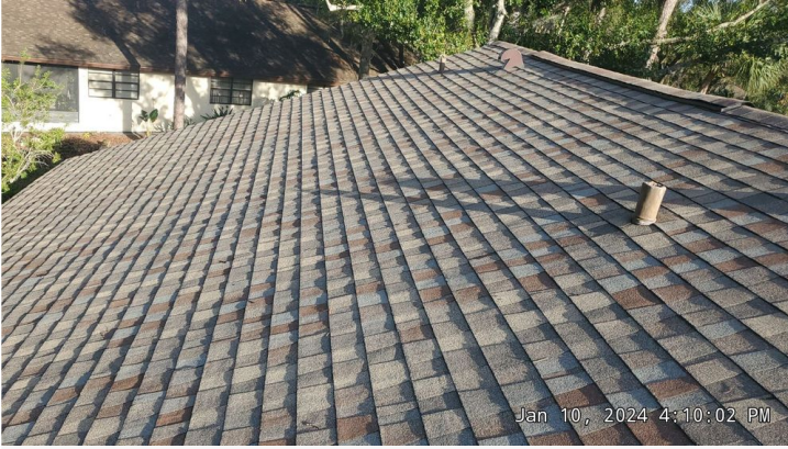
Project: STRATHMORE GATE - 4032-4036 HONEYLOCUST CT / 2310-5005622-01 Date: 1/10/2024, 4:10pm