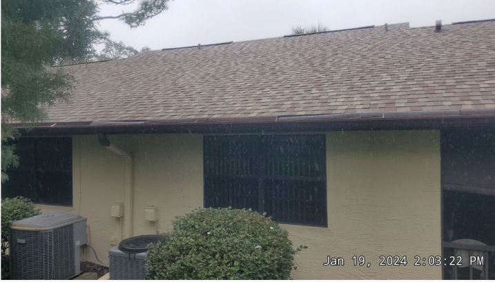
Project: STRATHMORE GATE - 4020-4030 HONEYLOCUST CT / 2310-5005605-01 Date: 1/19/2024, 2:03pm