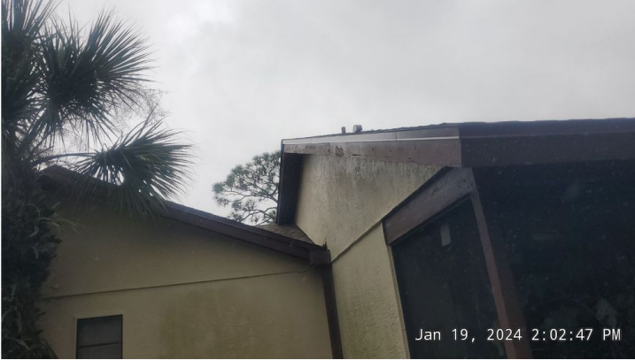
Project: STRATHMORE GATE - 4020-4030 HONEYLOCUST CT / 2310-5005605-01 Date: 1/19/2024, 2:02pm