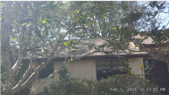
Project: STRATHMORE GATE -2937-2947 BUTTONBUSH CT / 2310-5006158-01 Date: 2/1/2024, 12:57pm