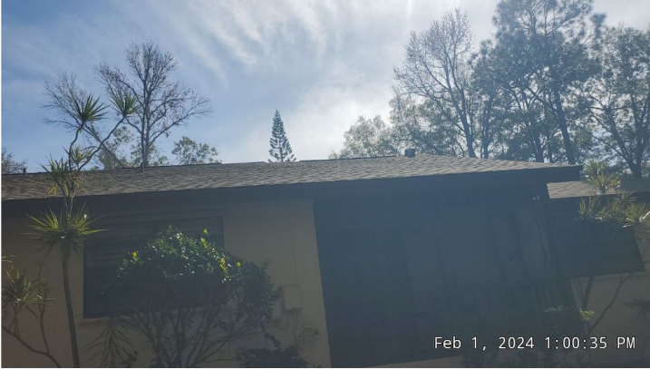
Project: STRATHMORE GATE -2937-2947 BUTTONBUSH CT / 2310-5006158-01 Date: 2/1/2024, 1:00pm