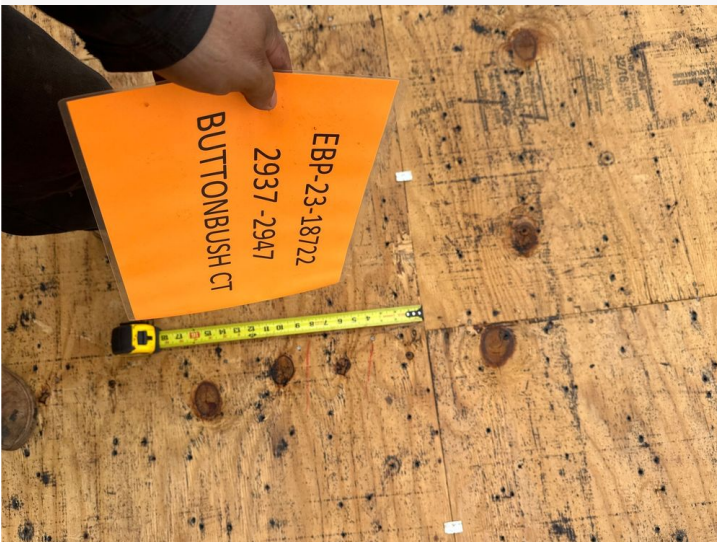
Project: STRATHMORE GATE - 2937-2947 BUTTONBUSH CT / 2310-5006158-01 Date: 1/29/2024, 10:58am