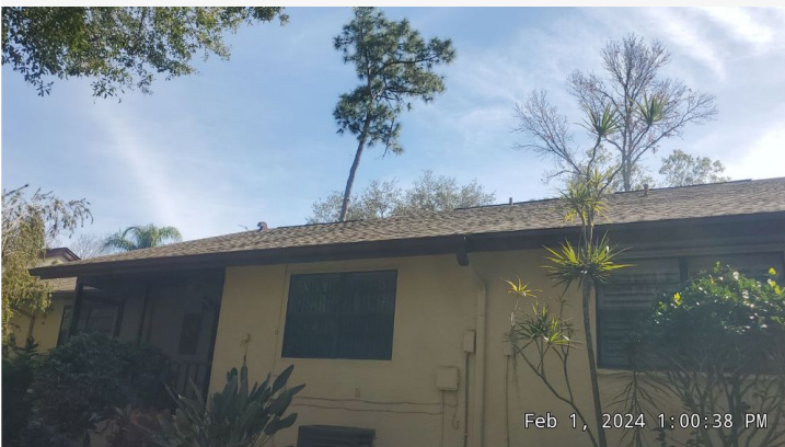
Project: STRATHMORE GATE -2937-2947 BUTTONBUSH CT / 2310-5006158-01 Date: 2/1/2024, 1:00pm