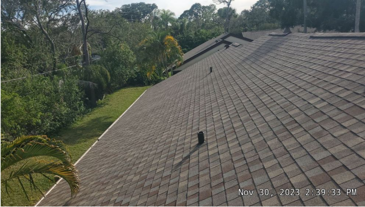
Project: STRATHMORE GATE - 2907-2917 BOXWOOD CT / 2310-5007341-01 Date: 11/30/2023, 2:39pm