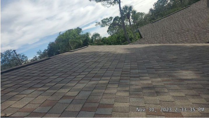
Project: STRATHMORE GATE -2907-2917 BOXWOOD CT / 2310-5007341-01 Date: 11/30/2023, 2:33pm