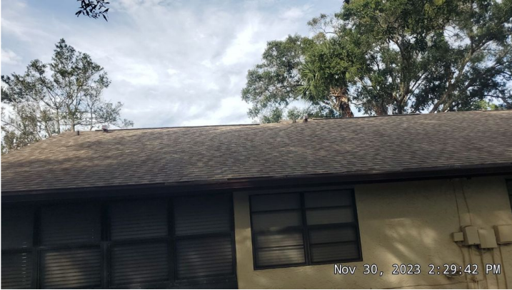
Project: STRATHMORE GATE - 2907-2917 BOXWOOD CT / 2310-5007341-01 Date: 11/30/2023, 2:29pm