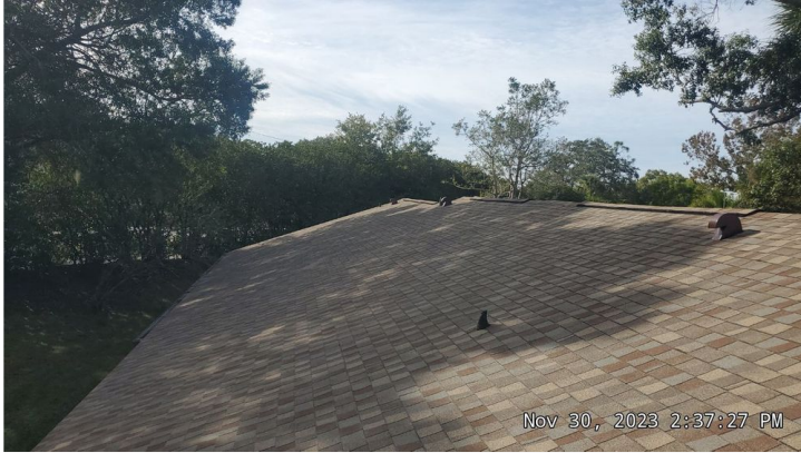
Project: STRATHMORE GATE - 2907-2917 BOXWOOD CT / 2310-5007341-01 Date: 11/30/2023, 2:37pm