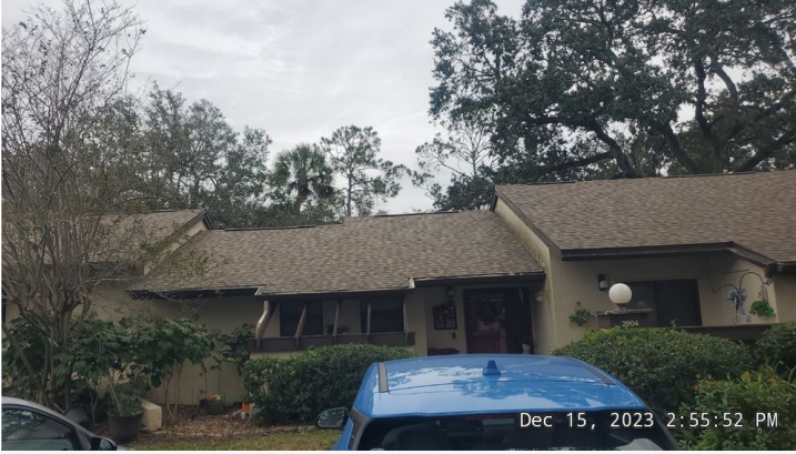
Project: STRATHMORE GATE - 2900-2910 STAR APPLE CT / 2310-5006484-01 Date: 12/15/2023, 2:55pm