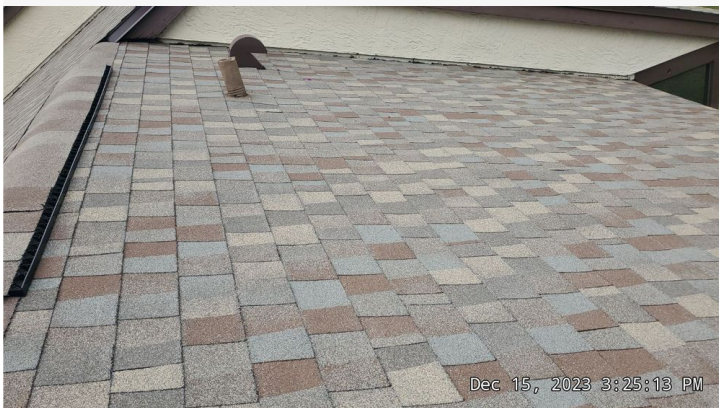
Project: STRATHMORE GATE - 2900-2910 STAR APPLE CT / 2310-5006484-01 Date: 12/15/2023, 3:25pm